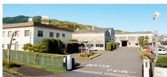
Head office factory

Nippon Reinetsu is making constant progress, growing from a company only in Japan to one that spans the globe.