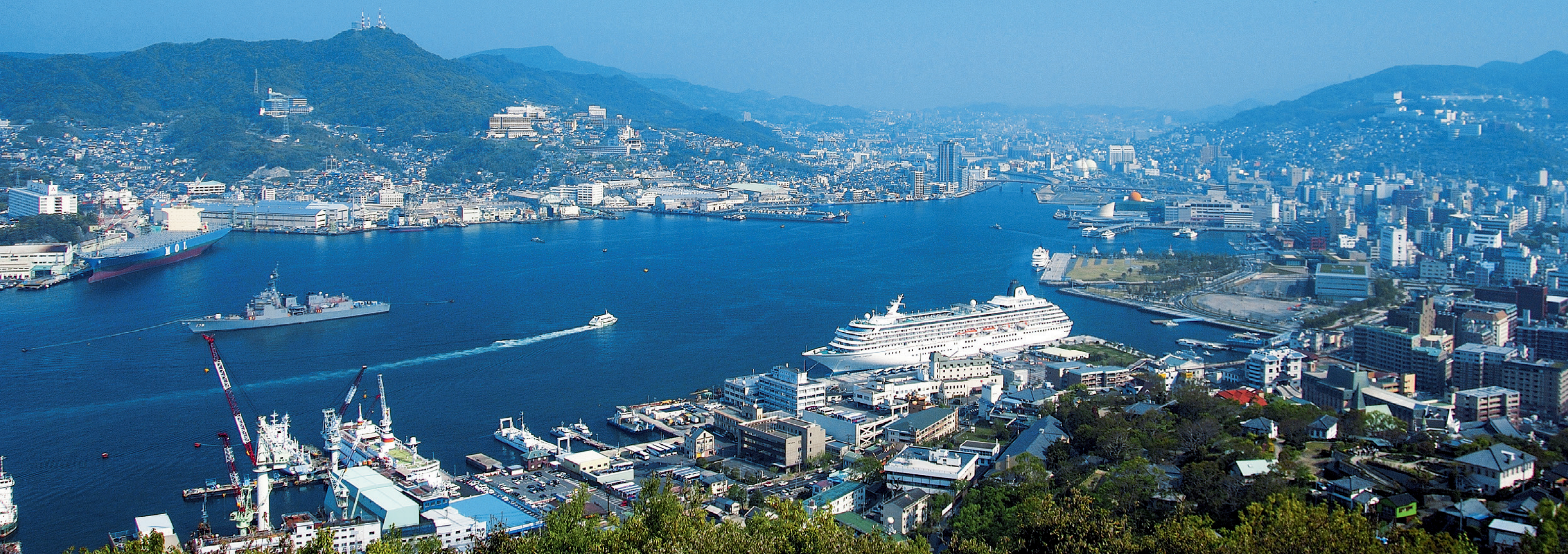
Port of Nagasaki