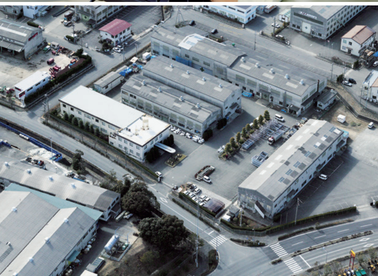
Head office factory